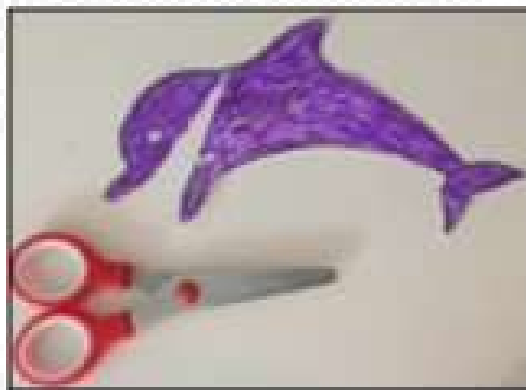
Cut a straight line from the mouth to the back of the head