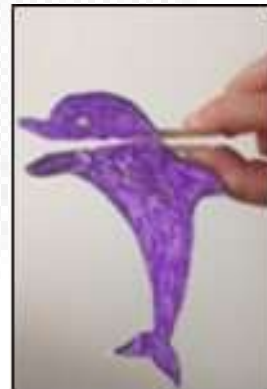
Squeeze the peg together to make the mouth move!