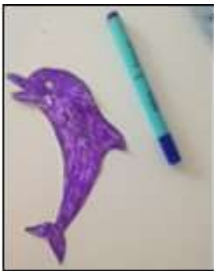
Colour and cut out Dolphin