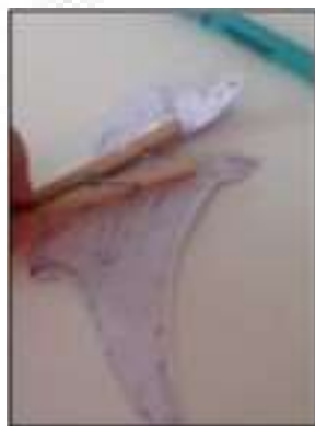
Stick the head on one side of the peg and the body on the other