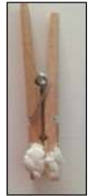
Stick the white tack on both parts of the peg