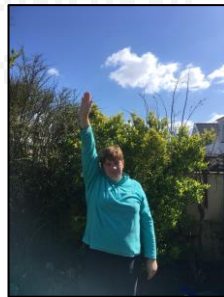
Return to me