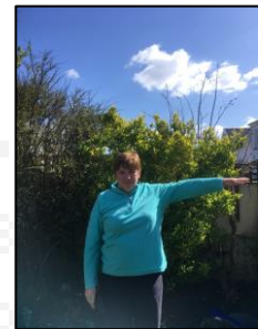
Move to my left (your right)