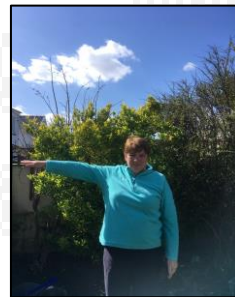
Move to my right (your left)