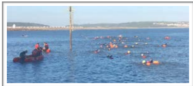
Open Water Swimming