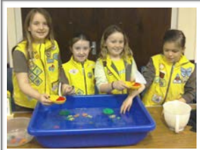
Youth Group Activities