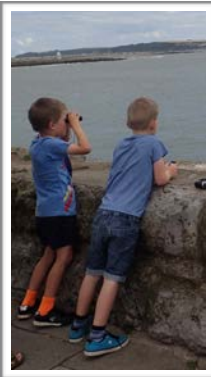
Porpoise and Dolphin Watch